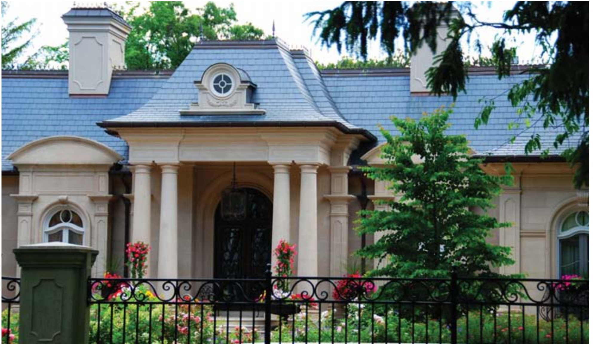
Timeless and Unique Estate Homes that offer all the special comforts of home