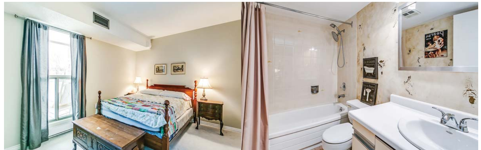
208-1225 NORTH SHORE BLVD E