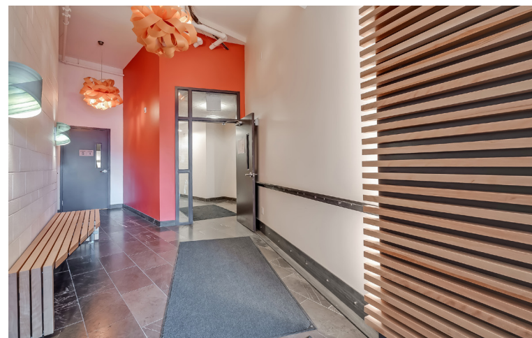
102-121 KING STREET EAST